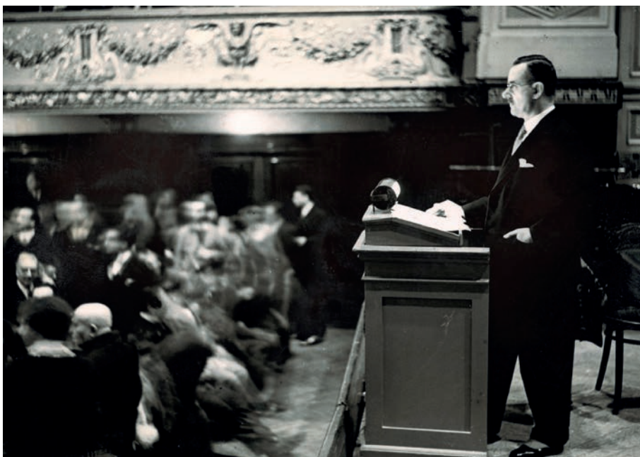
Thomas Mann during his "Deutsche Ansprache" (An Appeal to Reason) on October 17, 1930 in the Beethoven-Saal in Berlin

In the United States, where Mann had enjoyed widespread fame ever since winning the Nobel Prize in 1929, his political activities were followed with great interest. A brief visit in 1934 proved to be a rousing public success. In 1938 Thomas Mann emigrated to America, although it pained him to be so far away from Germany. In a famous interview with the New York Times , however, he showed his fighting spirit: "Where I am there is Germany!"