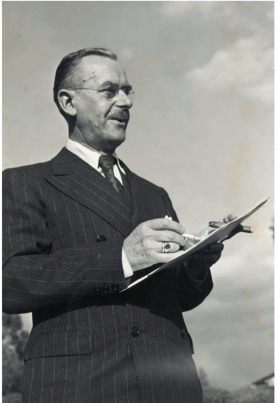
Thomas Mann, Pacific Palisades/ AMALFI DRIVE, 1941 TMA_3026