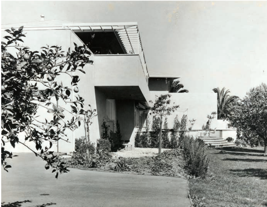
Above: Historical views of the Thomas Mann House