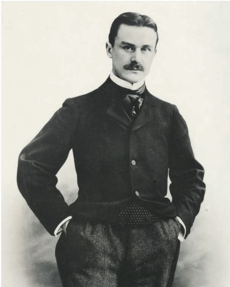
Thomas Mann, Munich, 1900